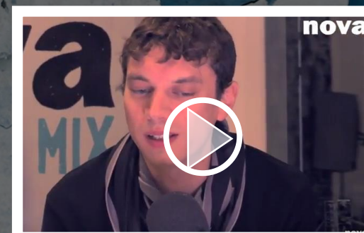
Radio Nova Interview