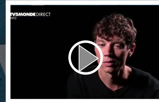
TV Monde Appearance